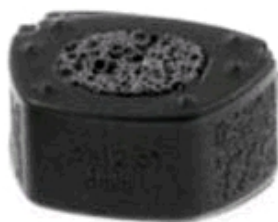
Valeo Composite (Monolithic + Porous Silicon Nitride)