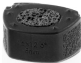
Valeo Composite ( MC 2 + C s C )

In 2009, we received a CE Mark to commercialize our Valeo interbody spinal fusion devices made from our composite silicon nitride. The porous C s C center structure of these devices is designed to facilitate bone growth into the device, which we believe will allow surgeons to reduce or eliminate the use of allograft bone and other osteoconductive biomaterials. We are currently marketing these devices in the Netherlands, Spain and Germany. Additionally, we are conducting a prospective clinical trial in Europe, named CASCADE, comparing our Valeo composite silicon nitride interbody devices to PEEK interbody devices to obtain additional safety and efficacy data to support the 510(k) clearance in the United States. The trial is 100% enrolled. We expect results to be available in the second half of 2014. If this trial is successful, we plan to file a 510(k) submission with the FDA by mid-2015.