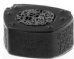
Valeo Composite (Monolithic + Porous Silicon Nitride)