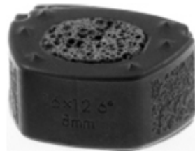
Valeo Composite (Monolithic + Porous Silicon Nitride)

In 2009, we received a CE Mark to commercialize the Valeo interbody spinal fusion devices made from our composite silicon nitride. The porous silicon nitride center of these devices is designed to facilitate bone growth into the device, which we believe will allow surgeons to reduce or eliminate the use of allograft bone and other osteoconductive biomaterials. We are currently marketing these devices in the Netherlands, Spain and Germany. Additionally, we conducted a prospective clinical trial in Europe, named CASCADE, comparing our Valeo composite silicon nitride interbody devices to PEEK interbody devices filled with autograft bone to obtain additional safety and efficacy data to support a 510(k) clearance in the United States. The CASCADE study enrolled 104 patients in a prospective clinical trial that independently scored fusion rates and clinical outcomes at 12 and 24 months follow-up. Neck Disability Index scores decreased similarly in both patient groups, consistent with clinical improvements reported in the literature. Importantly, the incidence of cervical spine fusion was statistically identical between study groups, and consistent with figures reported in other studies. In February 2016, we received questions from the FDA regarding our 24-month clinical study follow up within the 510(k) submission and we are currently in the process of formulating responses to the FDA's questions.